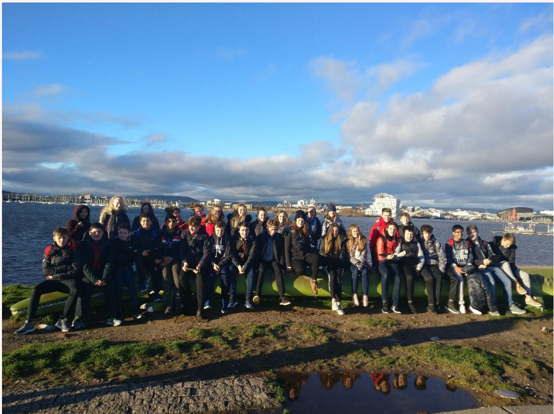
THE BEST WAY TO LEARN ABOUT A PLACE....VISIT IT! PUPILS ASSESSING THE REGENERATION OF CARDIFF BAY